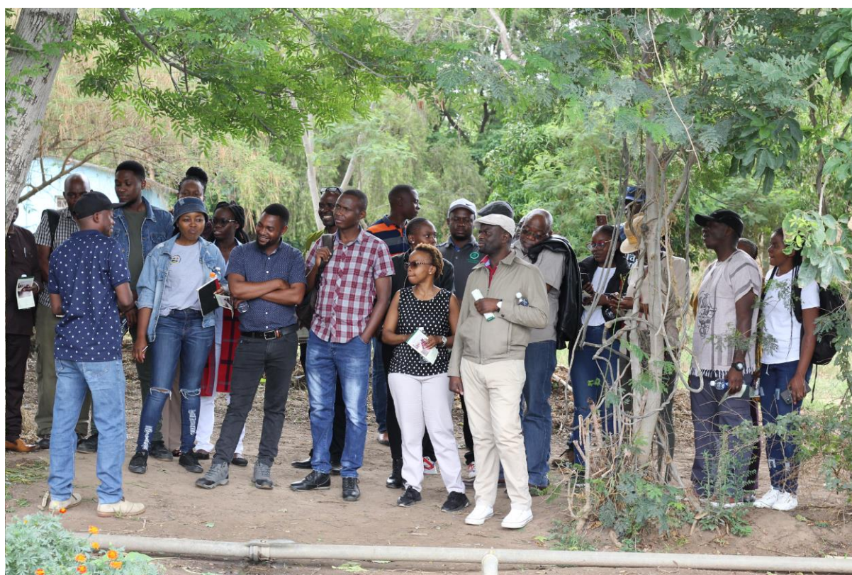
Figure 1: Workshop participants during a learning exchange visit to learn the Natural Waste Management initiatives practiced in Kasisi Agricultural Training Centre

The workshop was divided into two major activities. The first two days focused on lectures and discussions, and the third day was dedicated to learning exchange visits to waste treatment facilities in Lusaka. Participants were drawn from representatives of government institutions, the private sector, and academic and community-based organisations that deal with waste and natural resources management in Zambia (Annex 1). The workshop was attended by twenty-five (25) participants from different organisations, including representatives of CBOs, CSOs, and IPLCs in Zambia. Representatives from MWEKA, CWMAC and Repensar also attended the workshop.